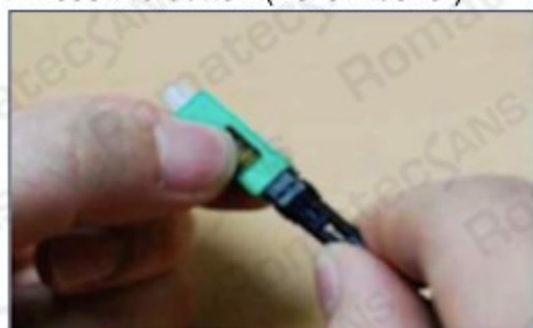
Press the button (Yellow cover)