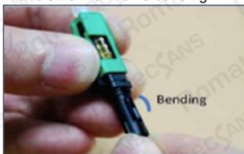
Make sure the fiber is bending