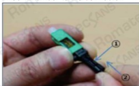
Insert the fiber to the connector