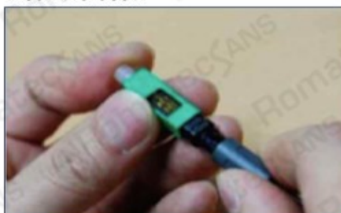
Lock the boot