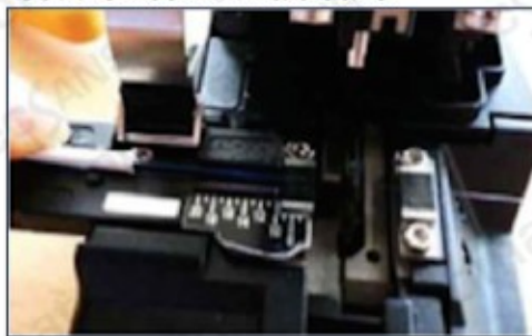
Cut the fiber with a cleaver