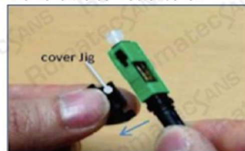
Remove the connector cover